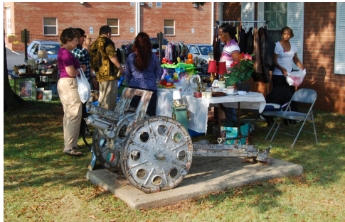
Scene for the Youth Committee's Yard Sale