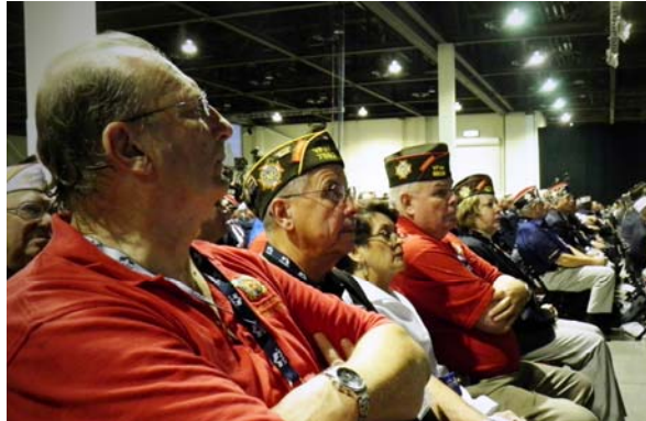
Part of the Virginia Delegation.