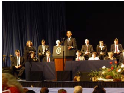
President Obama's address on 7/23