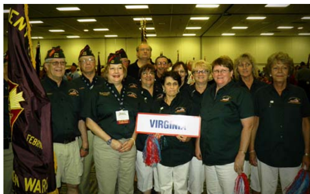
The Virginia team prepares for the patriotic rally.