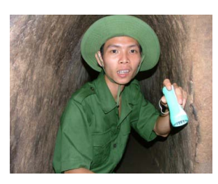
Inside Cu Chi Tunnels

Our first port of call was Vung Tau, located near Ho Chi Minh City, the former Saigon. Several options for land based tours were available and we chose to visit the Cu Chi Tunnels about a 2 ½ hour ride away. The tour focuses on the resilience of the Vietnamese fighters who both lived and fought from underground