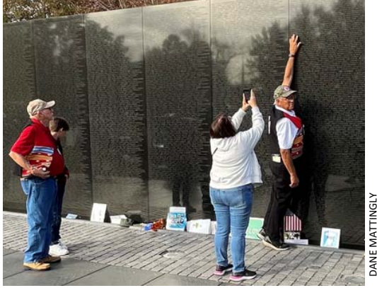
"The Wall" remains one of the top visitor attractions in DC