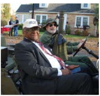
GLININIV I EWIS