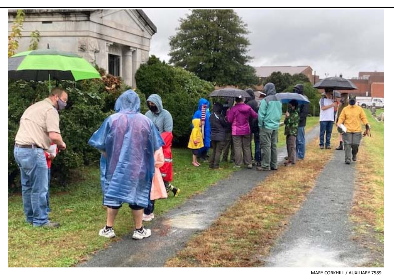
A rainy Veterans Day didn't stop our Scouts from placing flags on veterans' graves at the Manassas cemetery.