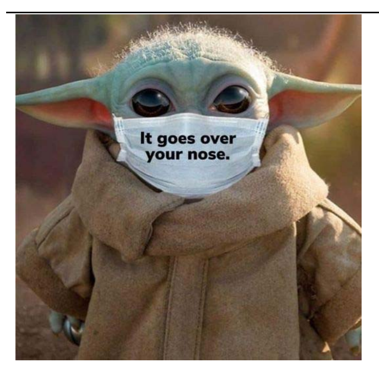
(Covid Continued from page 6)

ing letters to companies that claim their products can prevent, treat, or cure COVID-19.