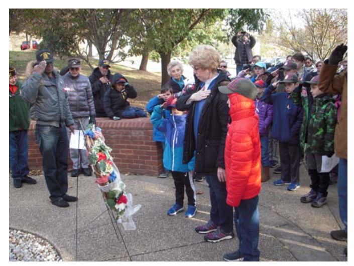
November 11: At the Manassas Veterans Memorial. Scouts: Cub Scout Pack 1355, Boy Scout Troops 670 and 1372 and Cub Scout Pack 1372