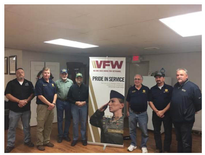
The Department delegation visited Grundy on November 10. The display is one of 3 the Department will use at recruiting events.

We visited Posts in Abingdon (1994), Damascus (9830), Bristol (6975), Coeburn (8652), Pound (9600), Clintwood (8975), Lebanon (9864) and Grundy (7360). Several Posts said they had