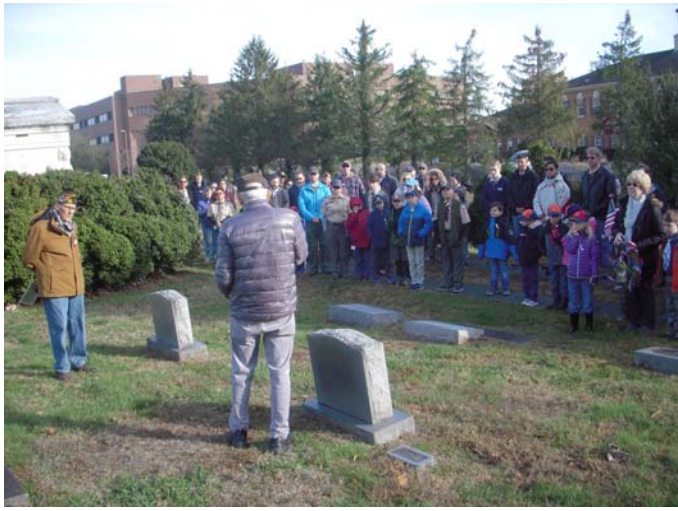
Honors and flag placements at Manassas Cemetery