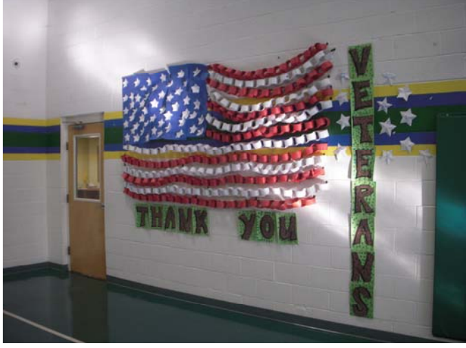
November 8: Manassas Christian School Salute to Veterans