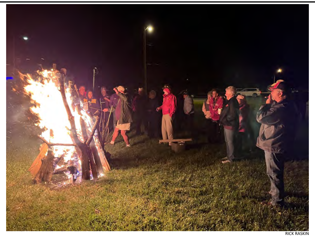
On October 7 a huge bonfire followed dinner and dancing at the State Commander's and State Auxiliary President's homecoming at Hillsville Post 1115.