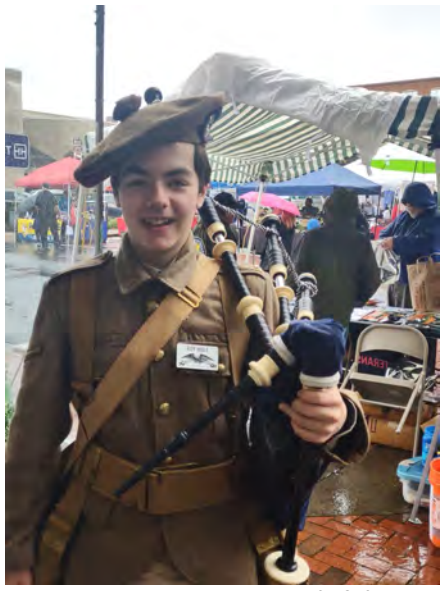
Our resident bagpiper.