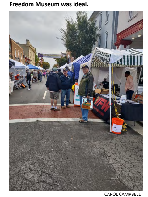
Working the soon to be crowd.