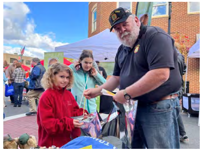
We distributed over 1500 safety bags and hundreds of glow stick bracelets