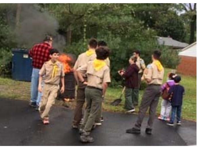
Cloth flags are retired by being burned. The ashes are then buried.