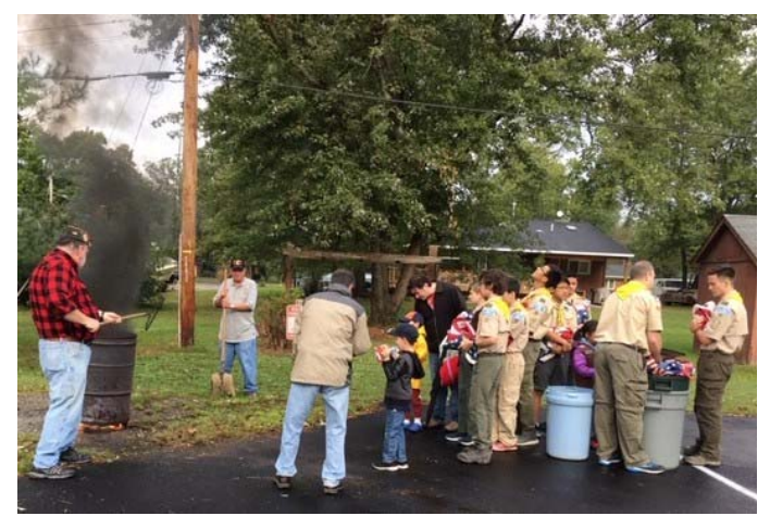
Preparing for the ceremony. Nylon flags which cannot be burned because of toxic fumes had their star fields removed before being disposed.