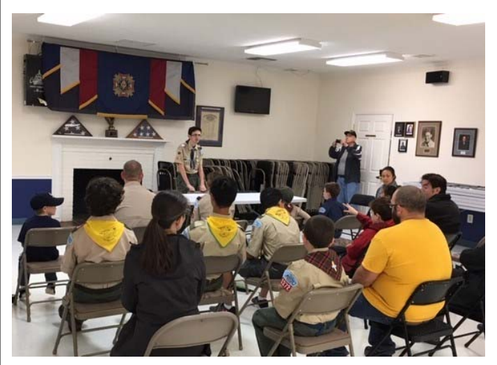
Flag education class was held prior to the retirement ceremony