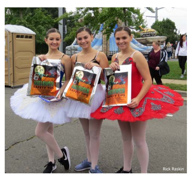
\label{eq:Trick} \mbox{Trick or Treat bags} - \mbox{always popular with the crowd.}