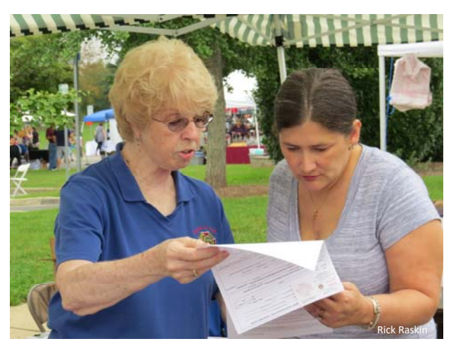
Interviewing a prospective Auxiliary member.