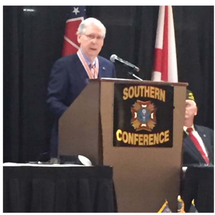
Senator Mitch McConnell speaks to the attendees about standing up for our values as Americans and preserving veterans' entitlements.