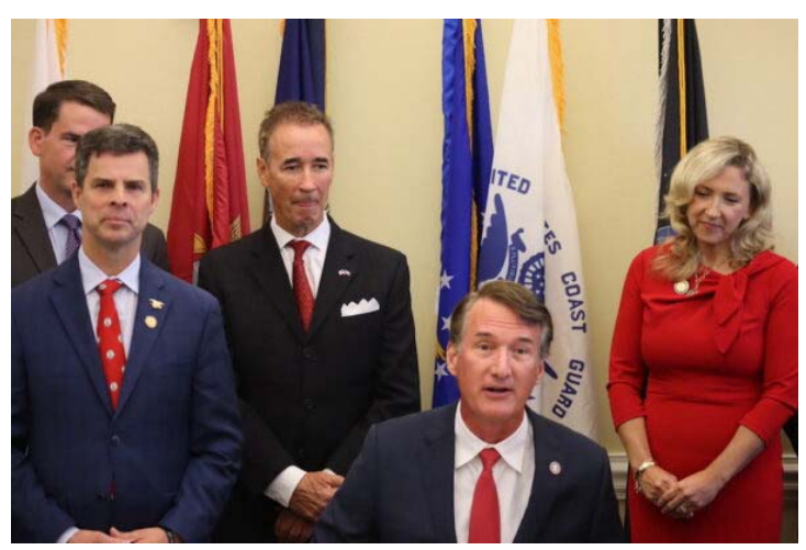
Virginia Gov. Glenn Youngkin (R) signs bills that alleviate taxes on military veteran pay at Quantico Corporate Center in Stafford County.

The region will soon be home to two new federal veterans' healthcare facilities. In Spotsylvania, The U.S. Department of Veterans Affairs is building a four-story, 450,000-square- foot clinic on a 48-acres at U.S. Route 1 at Hood Drive, opening next year.