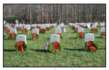
ant on November 11<sup>th</sup> & 12<sup>th</sup> from 9-2pm. Please let me know if you will be able to assist in this event.

The November annual Auxiliary Buddy Poppy drive will be at the Centreville Gi-