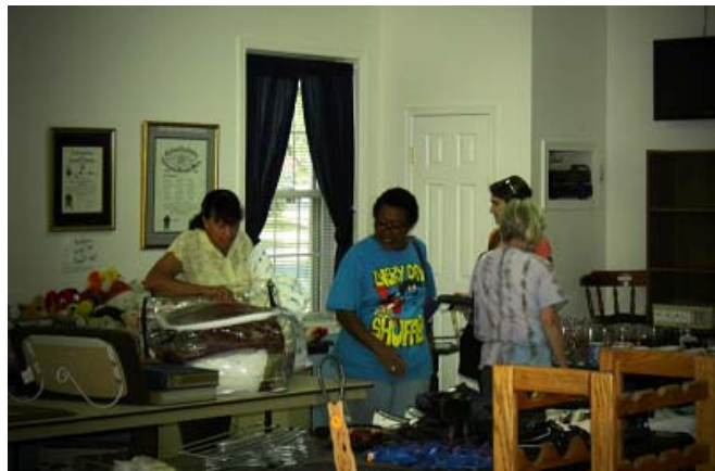
Customers browse the selections at the Youth Committee yard sale on September 7.

The Company has made some complimentary tickets available to the Post. Contact QM Rick Raskin for further information.