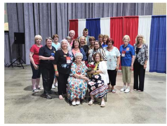
The Virginia Auxiliary's "Circle of Excellence"