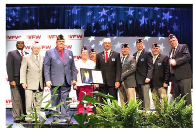
Virginia's 2020-21 All-American Commanders