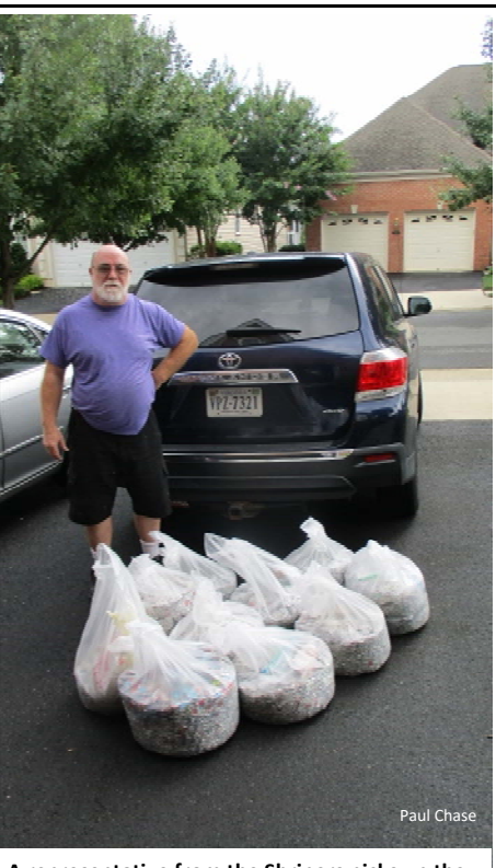
A representative from the Shriners picks up the 500,000 tabs donated in August.