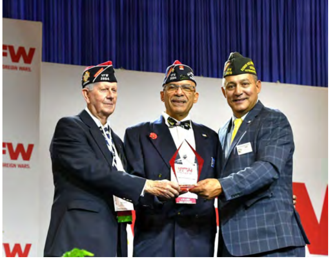
Community Service Post winner Chesapeake Post 2894