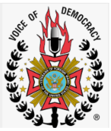
"Why Is The Veteran Important"