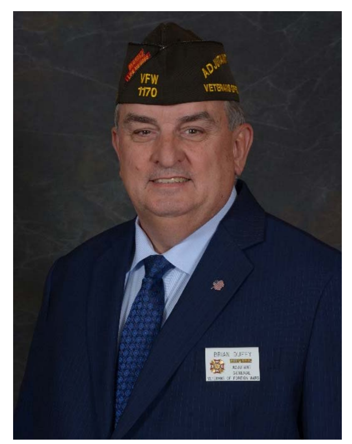
deployed in support of several campaigns, to include Grenada, Panama, and Operations Desert Shield and Storm in Southwest Asia. His military decorations include the Air Medal, Armed Forces Expeditionary Medal, Southwest Asia Service Medal, and the Kuwait Liberation Medal.

The VFW's new adjutant general served in the U.S. Air Force as a jet engine mechanic on F-4 Phantom fighter aircraft, and later as a flight engineer aboard C-141 Starlifter transport aircraft. He