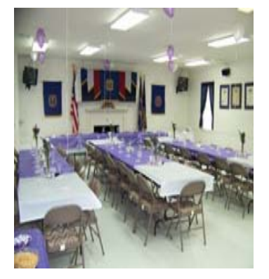
Public Rental Rates $200.00 for the 1st two hours $ 75.00 for each additional hour

Friday & Saturday Nights minimum Rental is 4 hours for $400.00