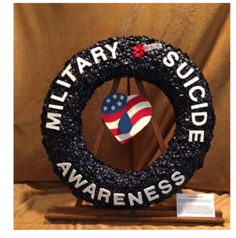
Auxiliary 7589's Buddy Poppy Display placed first in the State and was taken to the VFW National convention in New Orleans to compete at the National level.