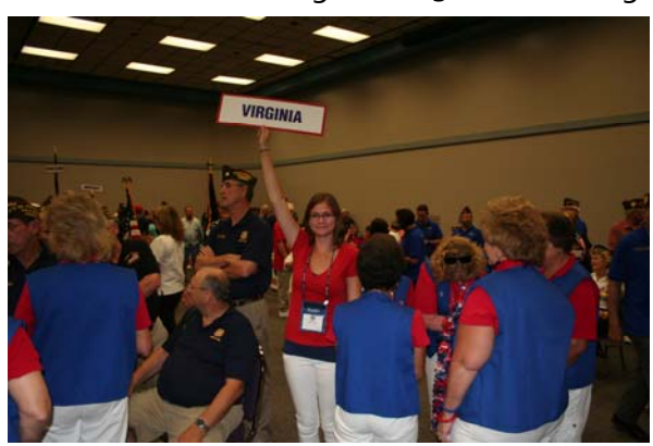
Virginia's participants in the Patriotic Rally at the National Convention gather prior to stepping off.