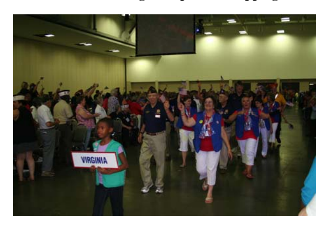
The Virginia delegation enthusiastically steps out.