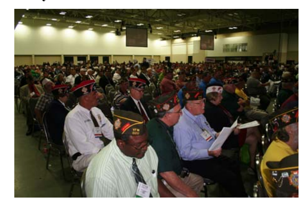
Part of the Virginia Delegation.