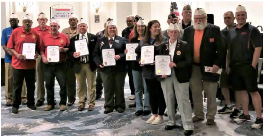
2023 All-State Quartermasters