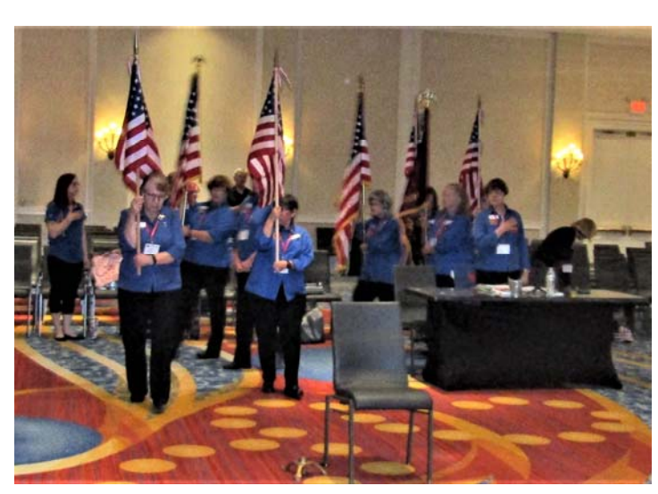
Flag ceremony at the opening of the Auxiliary's business session