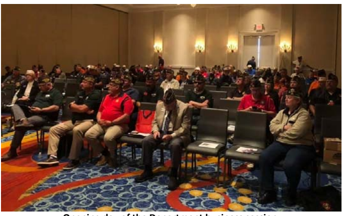
Opening day of the Department business session