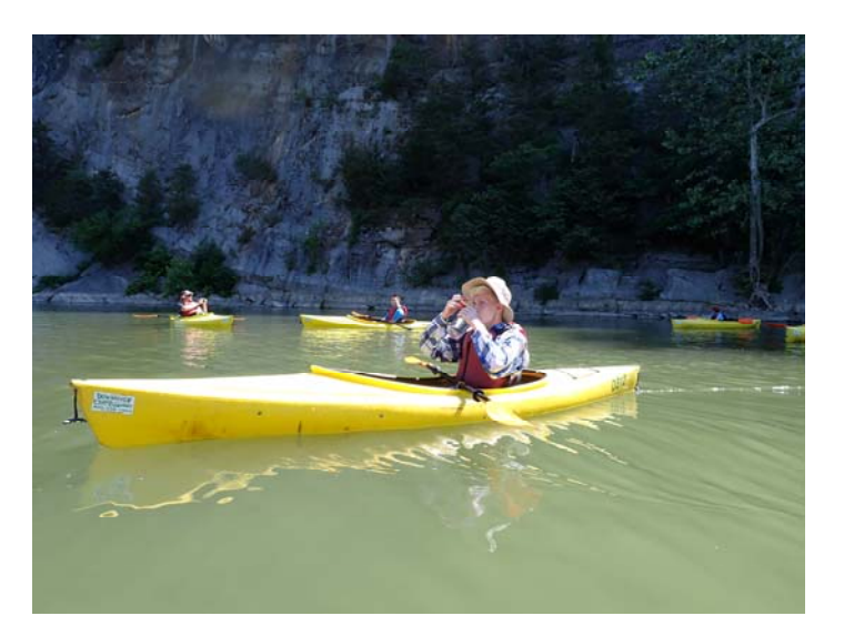
Scouts enjoy a day on the river, kayaking on the Shenandoah