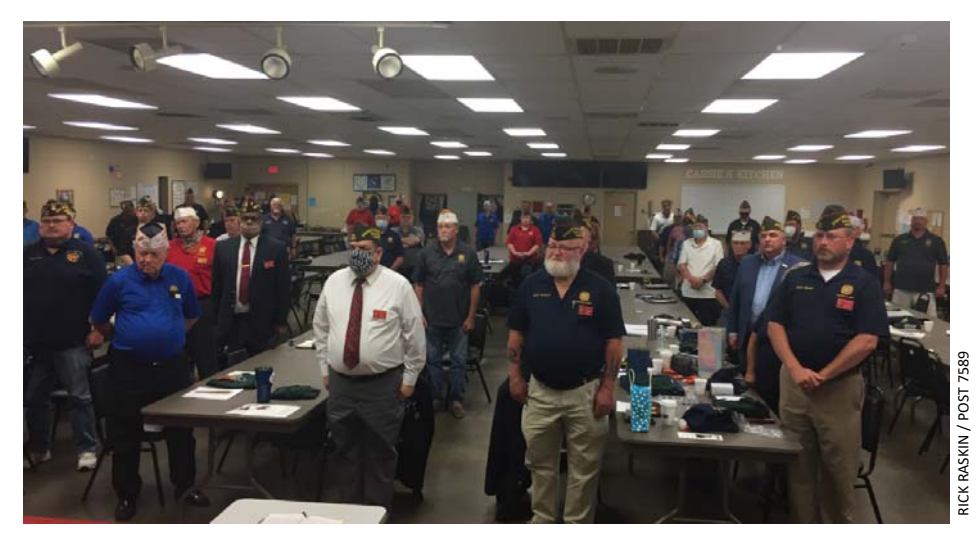
Attendees at the State Convention — A maximum of 50 were allowed in the room due to Phase 2 Covid restrictions