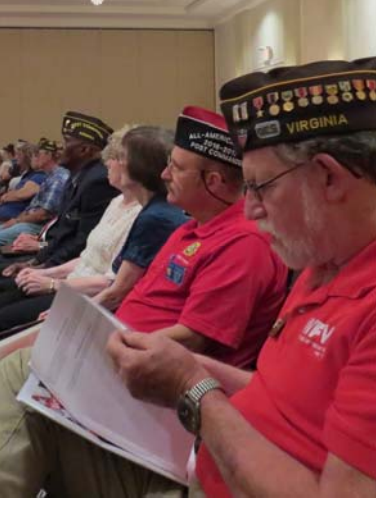
Posts 7589 & 9835 at the awards ceremony