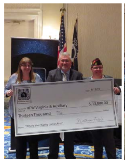
Powerhouse Gaming's $13K donation to the Auxiliary