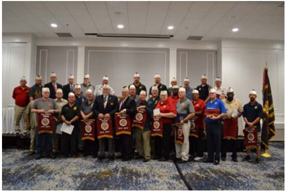
The 2016-17 All State Team.