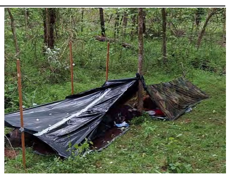
A typical Wilderness Survival shelter built by the Scouts.