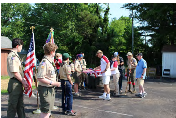
The Scouts prepare flags for retirement.