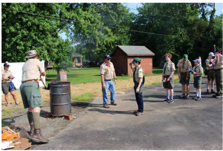
The Scouts respectfully retire unserviceable flags.