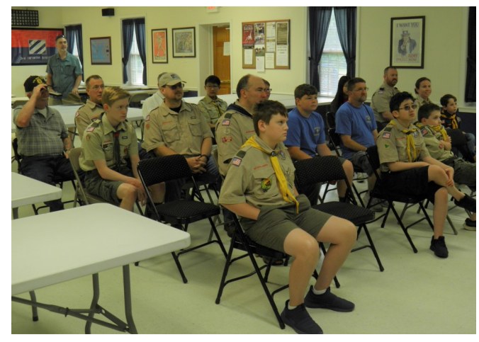
Flag education class was held prior to the retirement ceremony.