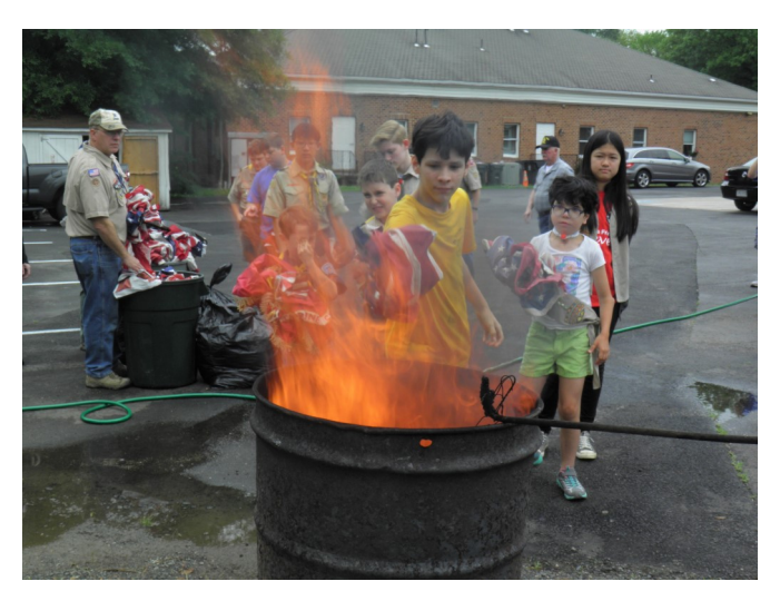
Approximately 1200 unserviceable flags were burned one at a time.