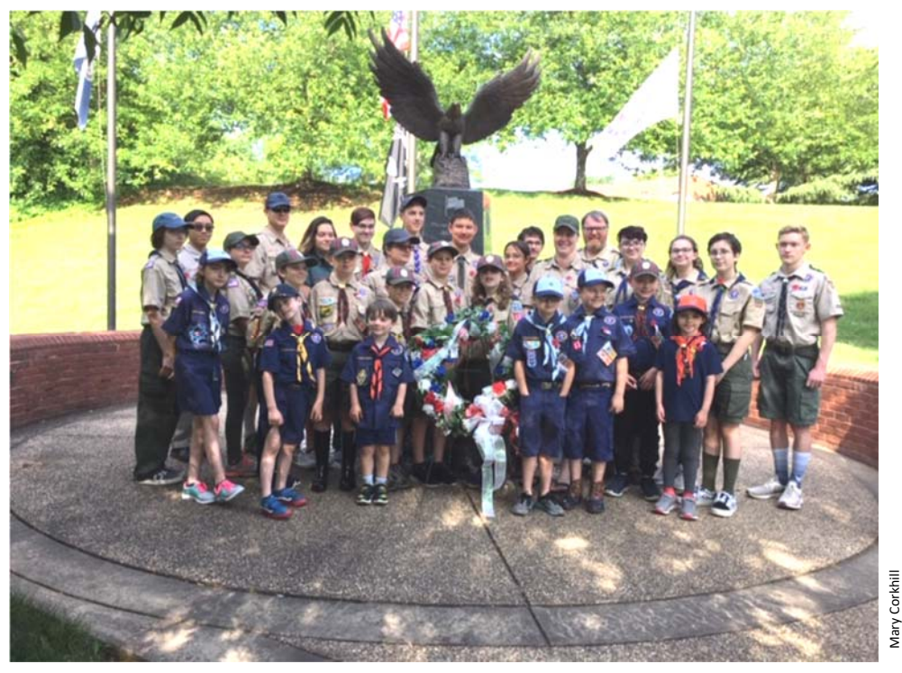
Manassas area Scouts gather at the Manassas Veterans Memorial on Memorial Day

NOTICE: On July 1 all expired annual members will be removed from our email list.