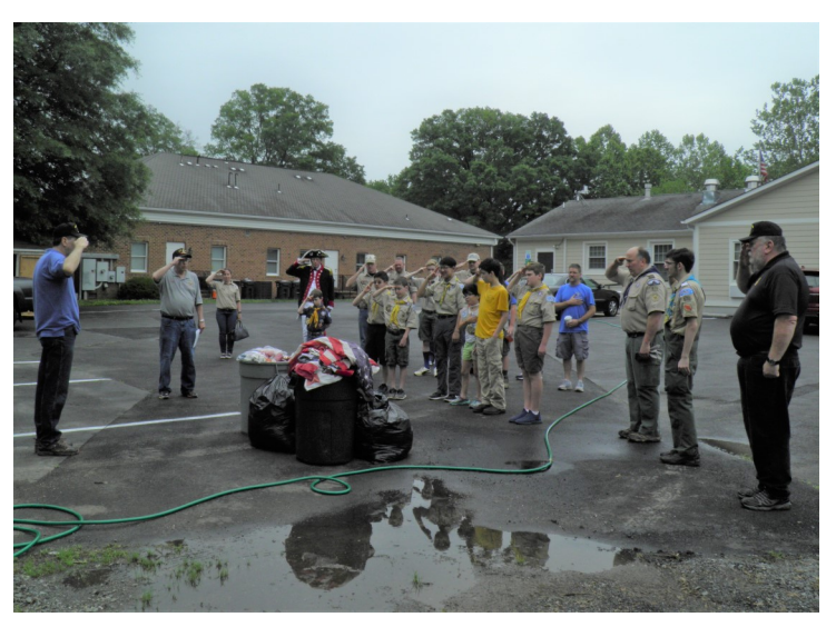
The Pledge of Allegiance preceded the destruction of unserviceable flags.