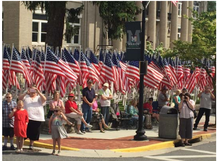
Over 1000 flags were displayed at the Smyth County courthouse; each one signifying a veteran who has passed on.