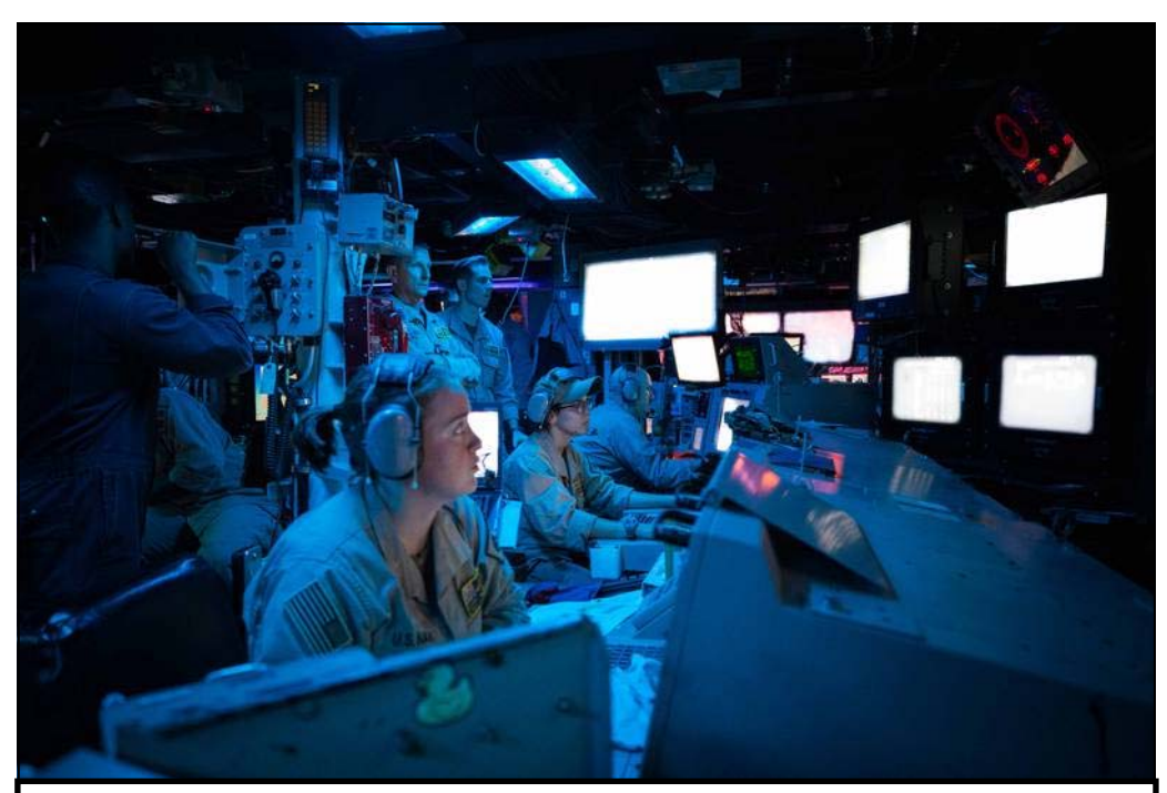
The salty sailors of the Navy destroyer Carney have spent months shooting down Iran-backed Houthi rebel attacks over the Red Sea.

Military Times article: https://www.militarytimes.com/news/your-navy/2024/04/25/navy-authorizes-combat-awards-and-devices-for-red-sea-operations/