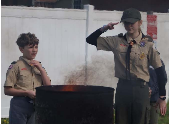
See more photos at: https://photos.app.goo.gl/f67jjMpB1uRVR7Fq8