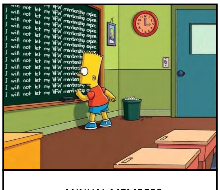
ANNUAL MEMBERS PLEASE RENEW YOUR MEMBERSHIP