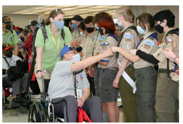
HONOR FLIGHT VOLUNTEER