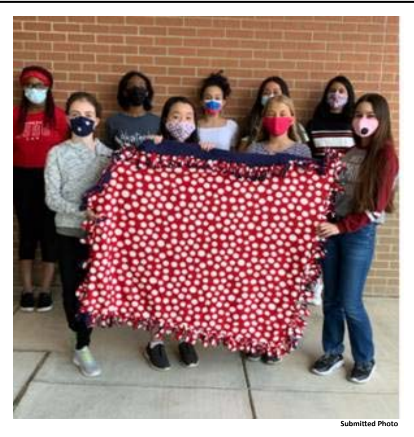
7th grade students at South County Middle School make blankets for veterans. See Page 7.