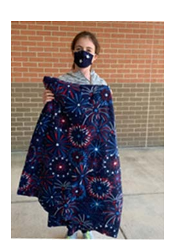
Blankets produced by the Purple Team on April 15, 2021