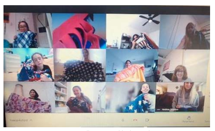
Meeting virtually to create blankets at home.

inviting only a few students to socially distance outside in order teach them how to make blankets. Every Thursday after school, a small group met virtually, and they make the blankets at home. As you can see in the pictures below, it was not quite the same as last year, but we felt like it was a good solution given the circumstances.