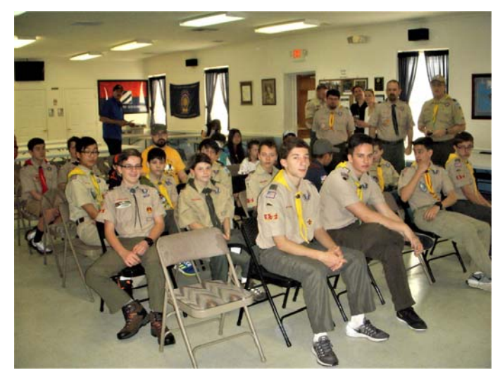
Scouts from Troops 670 of Manassas, 30 and 1865 of Centreville