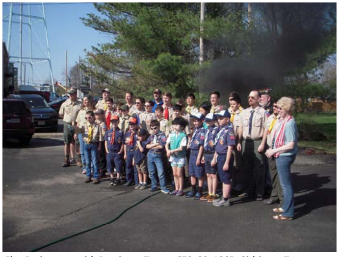
Flag Retirement with Boy Scout Troops 670, 30, 1865, Girl Scout Troop 3630 Centreville, Cub Scout Packs 1355 and 127