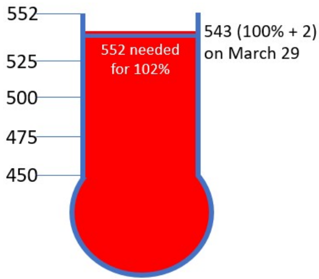
100% achieved on March 14