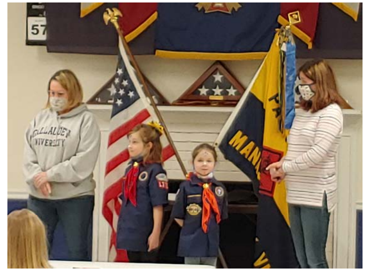
Two Cubs with their moms after being awarded their first rank.