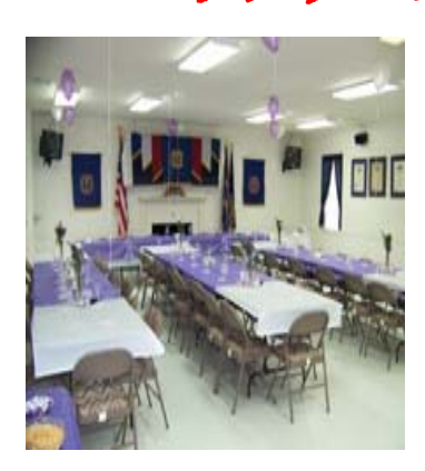
Public Rental Rates $200.00 for the 1st two hours $ 75.00 for each additional hour

Friday & Saturday Nights minimum Rental is 4 hours for $400.00