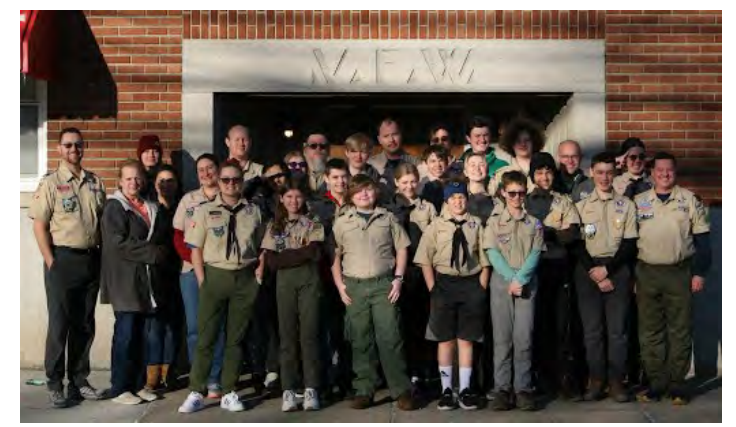
VFW Post 2250, Hornell, NY