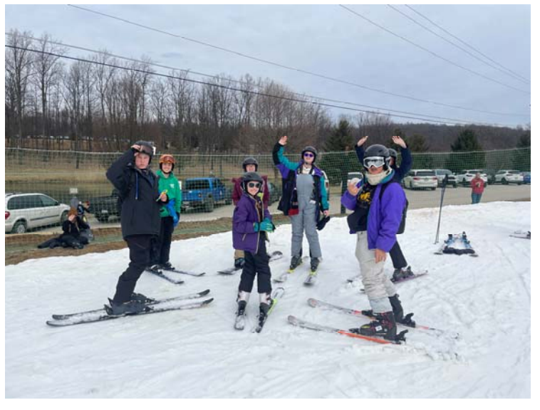
We had a group of Scouts that went to Round-Top for a day of skiing. They also continue to prepare for a weekend ski trip in NY where they will be staying with a local VFW Post.