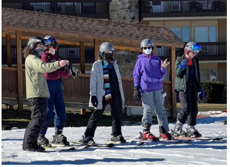
Scouts work on the Snow Sports merit badge