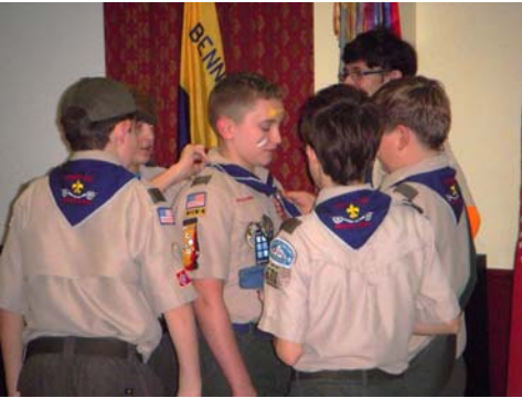
Boy Scouts welcome a new member show has crossed the bridge.