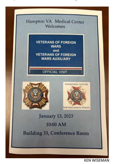
VFW VA made their annual visit to the Hampton VA Medical Center