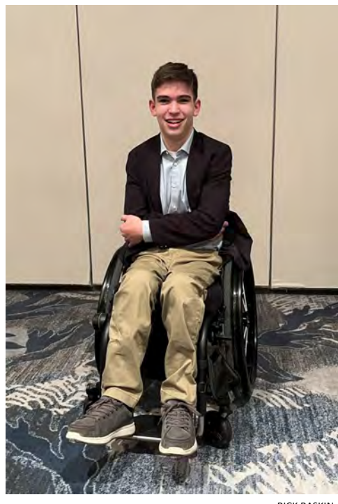
winners, at the

discussion involved future budgetary issues for the Youth Committee. Suggestions were made for expanding our role and assistance with our Youth and Scouting programs. No specific actions have been implemented yet but in the near future we will be even more active in the Scouting and school community. I will report these exciting developments in the next newsletter once everything is finalized.