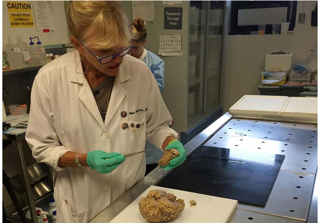
A study carried out with the help of VA's National PTSD Brain Bank has yielded new insights on changes that occur in the brain of those affected by PTSD.

January 6, 2021 By Peggy Willoughby VA National Center for PTSD