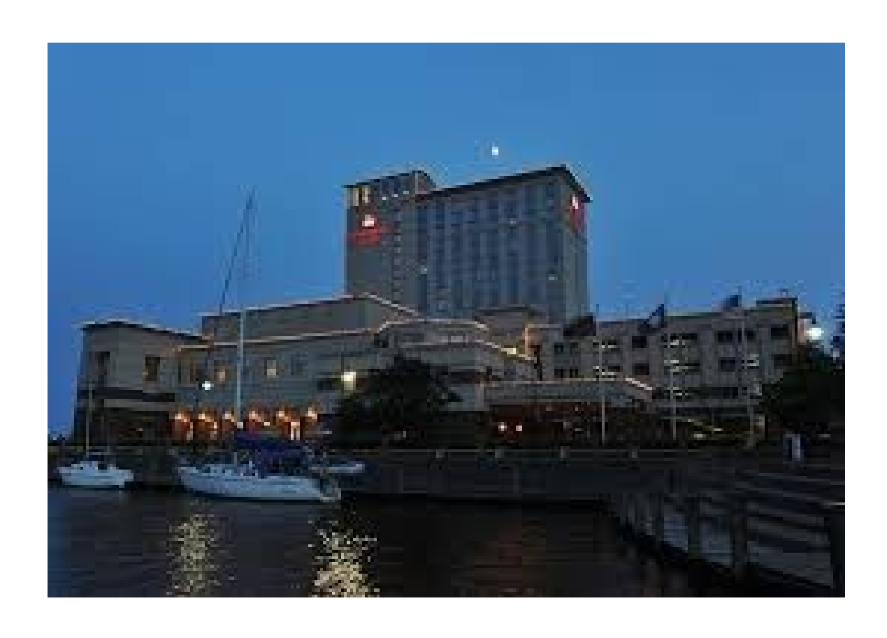
July 8-11, 2021 Renaissance Portsmouth-Norfolk Waterfront Hotel 425 Water Street Portsmouth, VA 23704