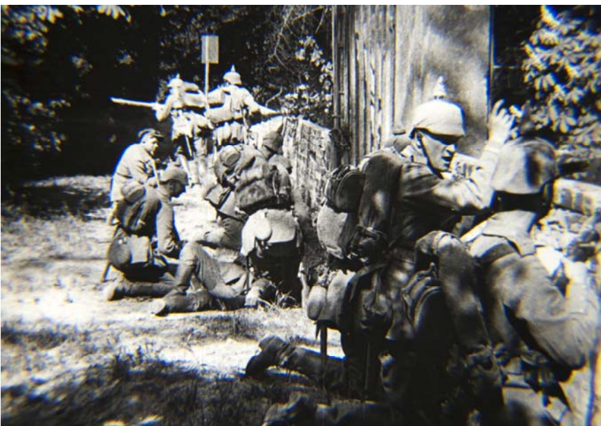
From "On the Firing Line with the Germans"

The Library of Congress Gazette is the Library's employee newsletter. This article is reprinted with permission from the editor.