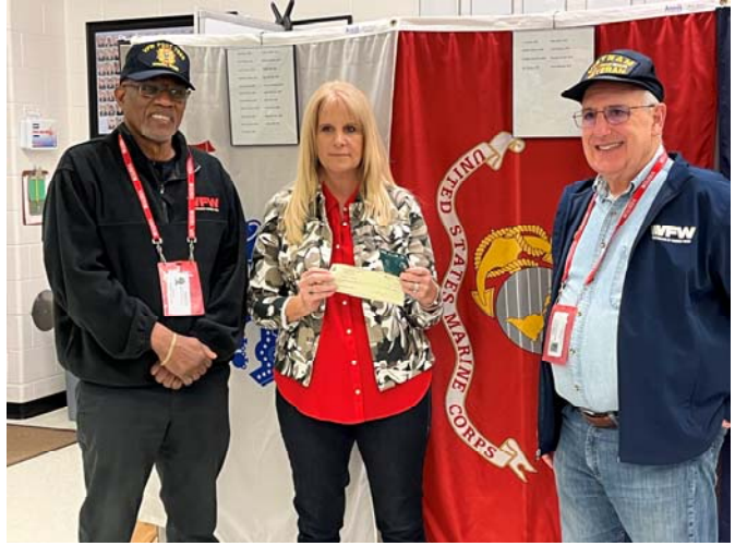
BATTLEFIELD HS AFJROTC