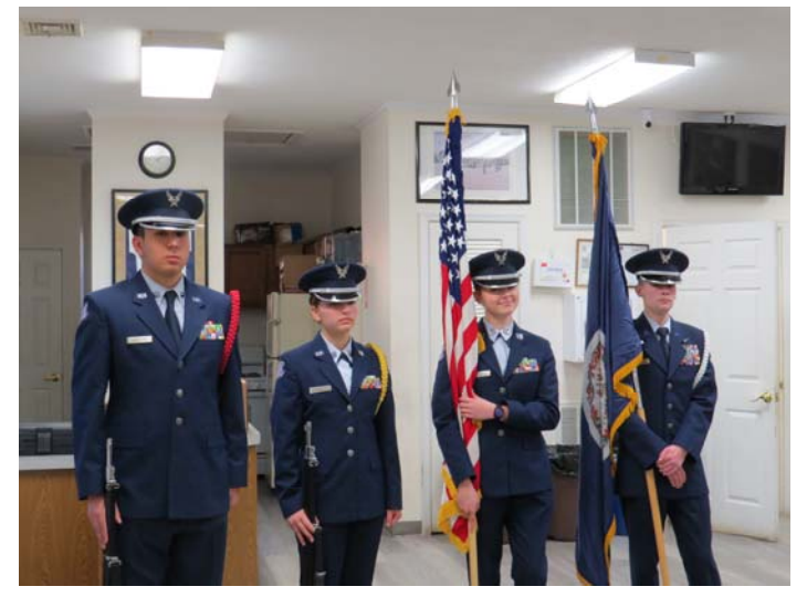
Battlefield High School JROTC Color Guard