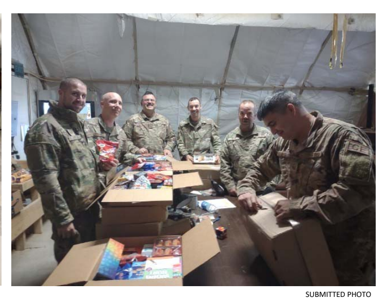
The packages arrived in good condition and were enjoyed by the troops

Another batch of goodies ready to be packaged