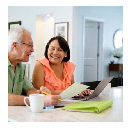
Social Security Public Affairs Specialist in Virginia

If you did not apply for Medicare Part B (medical insurance) within three months before or after turning age 65, you have another chance each year during the General Enrollment Period. The period runs from January 1 to March 31 every year.