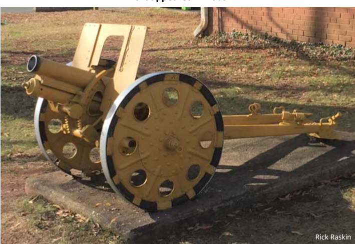
2018 after restoration