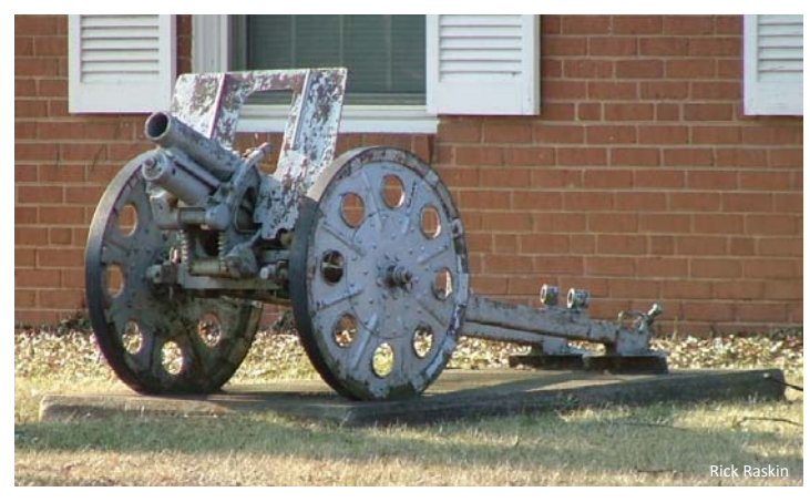
As it appeared in 2009

The Japanese 70mm Type 92 Field Gun that has adorned the Post home has been restored to its original appearance. Historic Restoration Committee, a not for profit organization that seeks out and restores Japanese war relics offered to do the work for the cost of materials. The Post approved the project at the December meeting and the work was completed December 20.