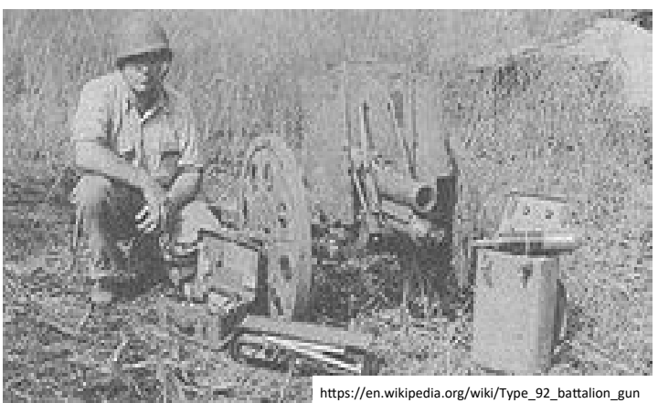
Type 92 battalion gun captured on Guadalcanal