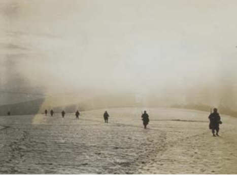
George S. Patton, photographer: Engineers (clockwise from top) pose on a bridge they built over the Sauer River into Germany; Silhouetted infantrymen cross a snowy field during the Battle of the Bulge; GIs get stuck in the mud in France.

"His photo albums are just like yours and that we take and photographs that other people take that we like and put into our albums."