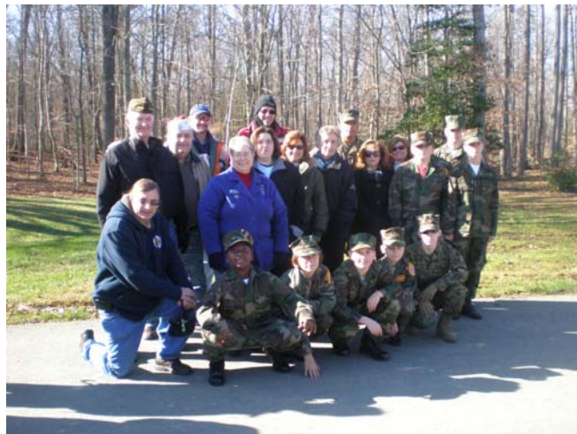
Post/Auxiliary Members & Manassas Young Marines who assisted at Quantico National Cemetery's Wreaths Across America on December 12, 2009