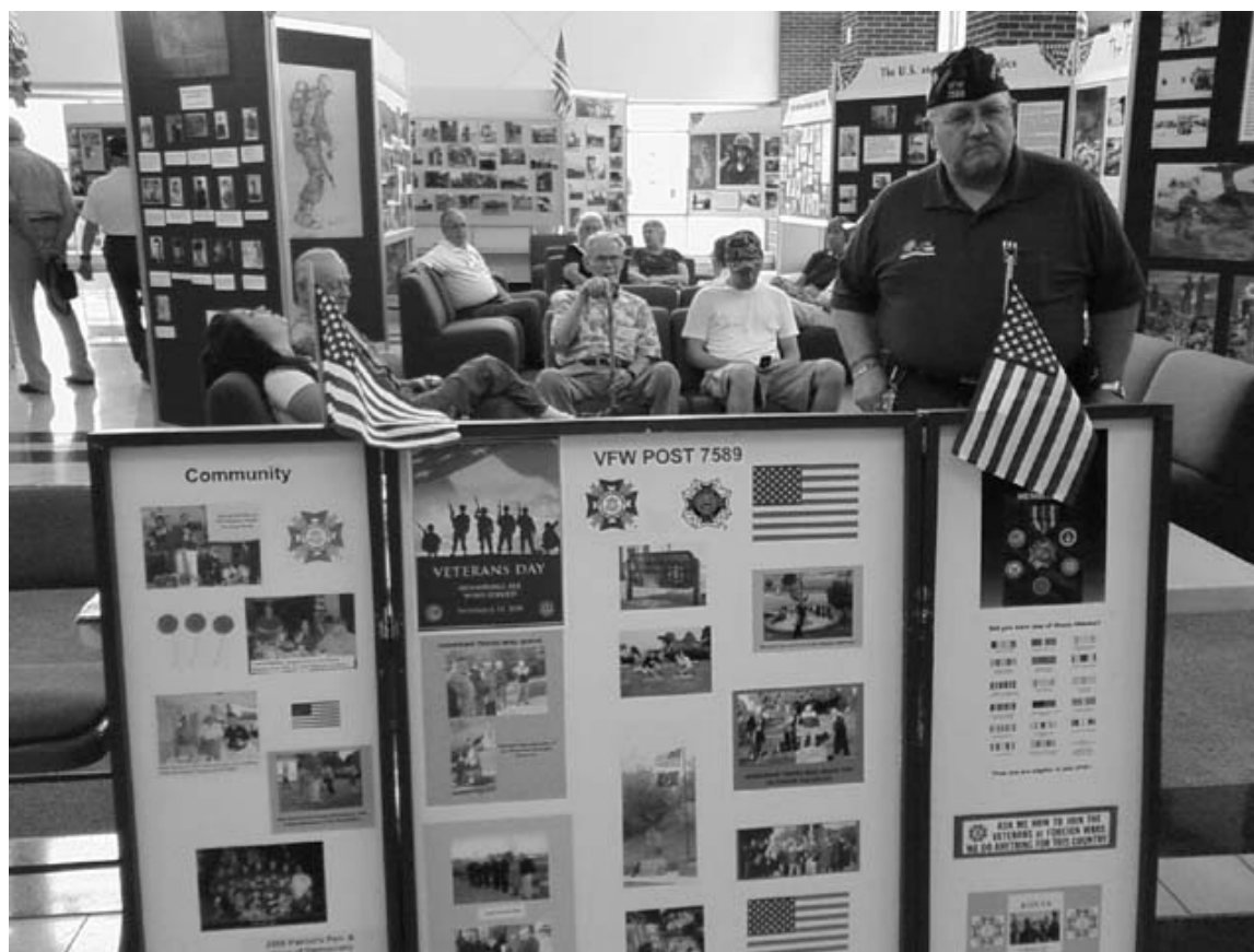
Commander Meade manning VFW Post 7589 Booth at Freedom Museum on July 4th