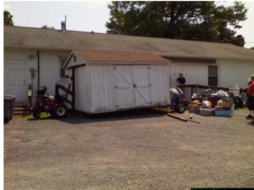
The shed was relocated prior to breaking ground.