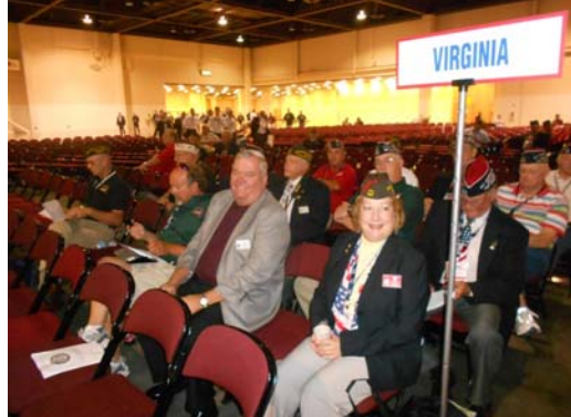
Part of the Virginia Delegation ready to rock and roll!