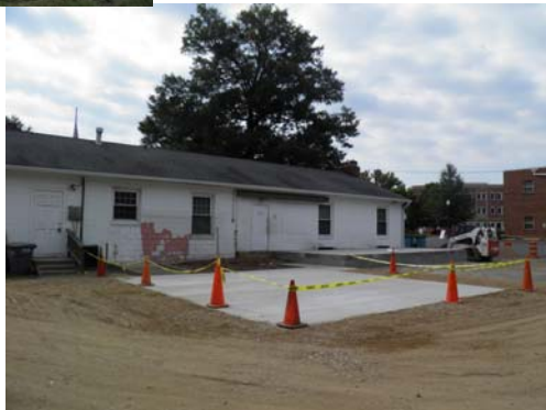
Handicapped parking and ramp access will be near the kitchen door.