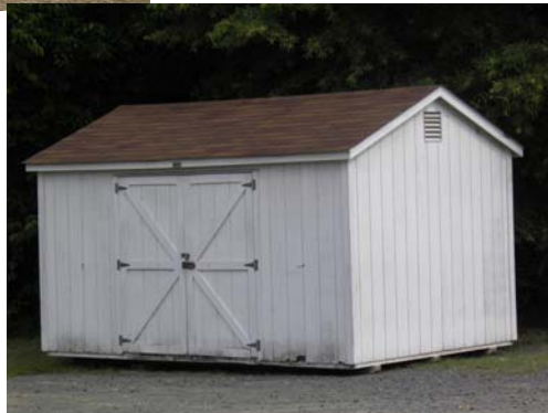
It found a new home at the back of the parking lot.