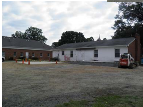
New offices will be located on the right side.