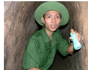
Inside Cu Chi Tunnels

Our first port of call was Vung Tau, located near Ho Chi Minh City, the former Saigon. Several options for land based tours were available and we chose to visit the Cu Chi Tunnels about a 2 ½ hour ride away. The tour focuses on the resilience of the Vietnamese fighters who both lived and fought from underground tunnels. Originally constructed to fight the French by the Viet Minh, the tunnels were later expanded up to 12 meters below ground using only rudimentary tools. I was especially taken by the quality of the engineering that went into their construction. I was also impressed by the human engineering where such factors as venting of smoke and masking of