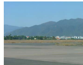
Nha Trang Airbase – looking towards the old US base

The following day the ship anchored at Nha Trang and we were tendered into the port. Since I had spent the better part of a year there we opted to hire a cab and explore on our own. I was able to get a few photos from some of the same locations I had visited before, but recognized little today. After some confusing conversation with our cab driver we drove to the old unused airbase, and thanks to a friendly guard I was allowed to take a few pictures across the airstrip. Nothing remains from my US Army days except the runways and terminal building. Nha Trang has grown about 4 or 5 times the size I remember and the once deserted beach is now lined with high rise hotels and restaurants. Monkey Island is now a resort and is connected to the mainland by an aerial tram. Hon Tre Island, once a leper colony, is also populated with