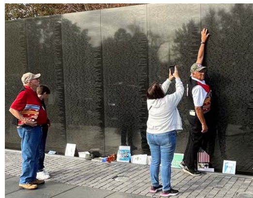
"The Wall" remains one of the top visitor attractions in DC