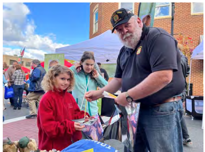
We distributed over 1500 safety bags and hundreds of glow stick bracelets